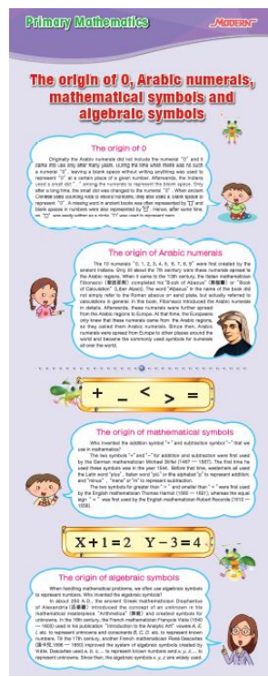
※ 60(w) x 160(h)cm