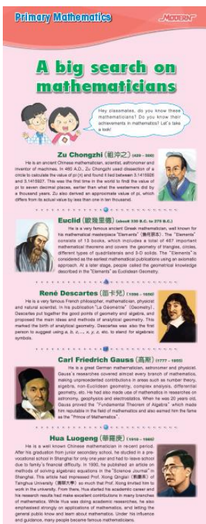
※ 60(w) x 160(h)cm