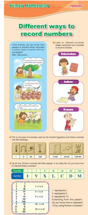
※ 60(w) x 160(h)cm